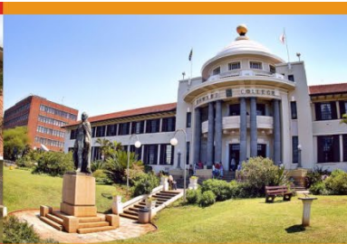
HOWARD COLLEGE CAMPUS